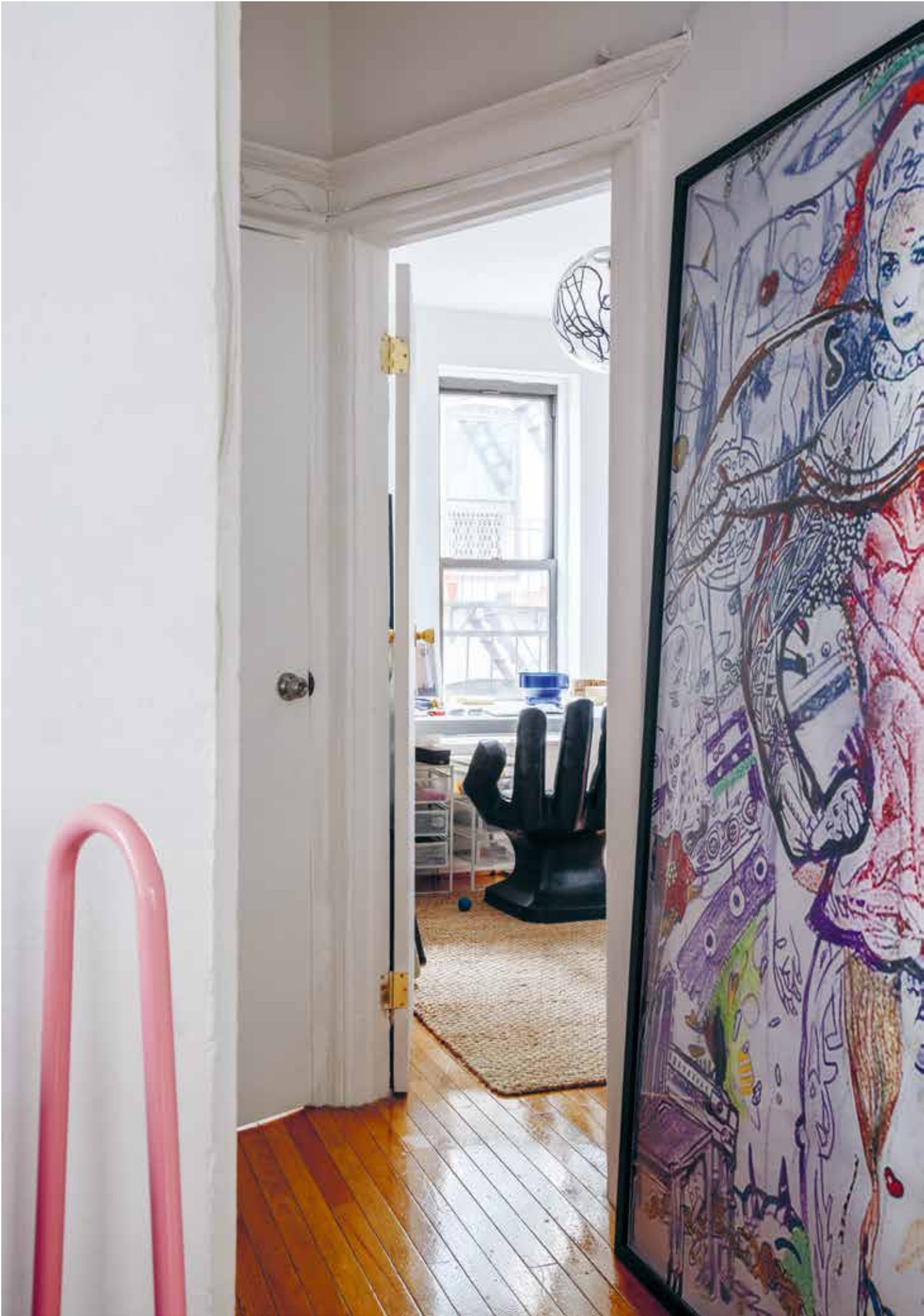
He found the hand-shaped plastic chair on the street.