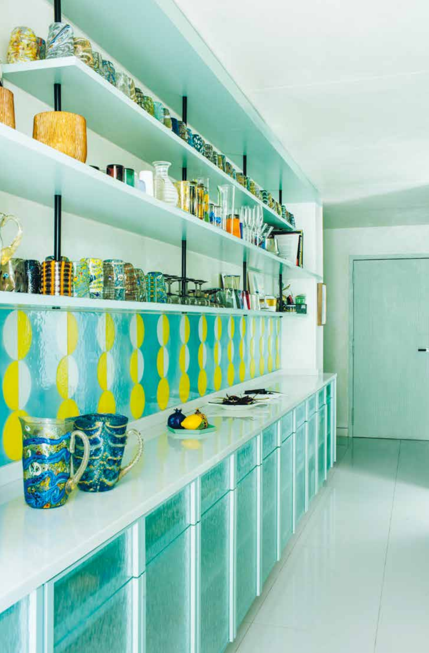
The kitchen was inspired by the dotted tiles of the iconic Italian designer Gio Ponti. The glass tiles were handmade by StudioSilice: an artisanal workshop in the heart of Rome.