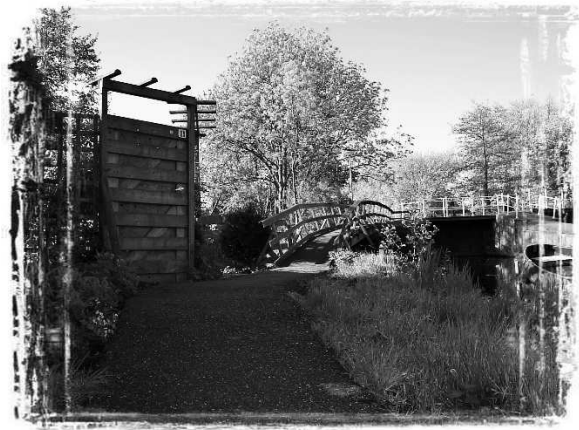
SCHOOL-IMAGE FOR SIMILAR SCENES AT SMALL BRIDGES...