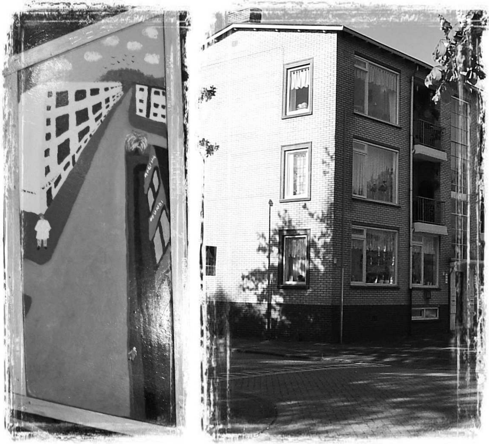
SPRING 1962, AGE 9-10 YEARS, 800 m. FROM HOME