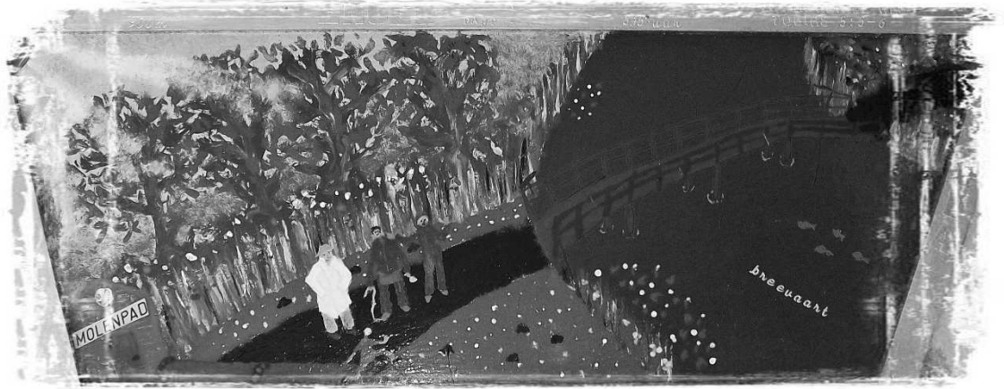
SPRING 1961; AGE 8-9 YEARS; 600m FROM HOME

Again on the way to school, but now one year later, and further from home; and this time not alone, but walking with brothers and sisters; and reaching a point where a long and small and instable wooden bridge had to pass over. Some acquaintances from our Parish were busy with construction works nearby. When they saw us coming, they came to the path to greet us. The next moment it was a total Papist meeting. Next to the acquaintances stood a more dignified person; who seems to participate in the conversation; but what came out of his mouth was an unarticulated murmur; but on the tones of this murmur the whole body was filled with a nice warmth; so immediately I knew that this person was an Angel. (Luke 24:32. And they said one to another, did not our hart burn within us, while He talked with us by the way, and while He opened us the scriptures?)