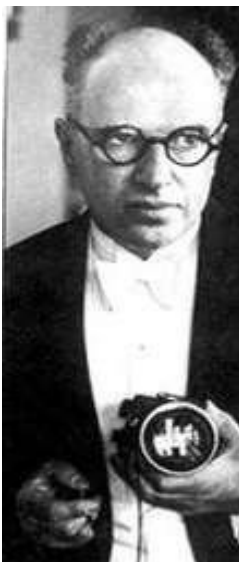
This is his own portrait