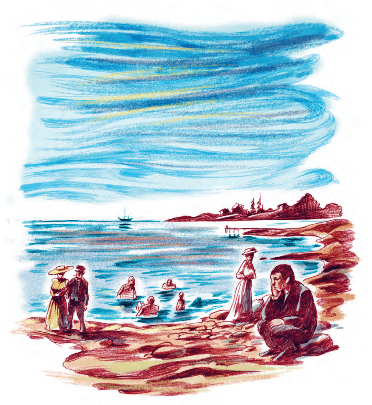
A man and a woman are getting into a boat. Another man is gazing out over the water.