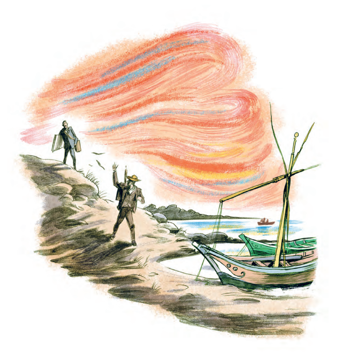
Soon they find a good place to stop.