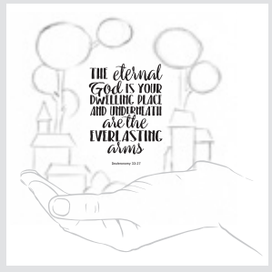
1 Begin sketching simple shapes and forms. In the example, the picture is curved around the text.

Make a beautiful drawing; it's not difficult!