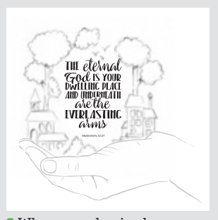
2 When your basic shapes are the way you would like them, work out your drawing. Try to add shadows for more depth.