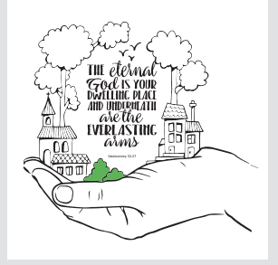
4 Finally, add a splash of color to your drawing!